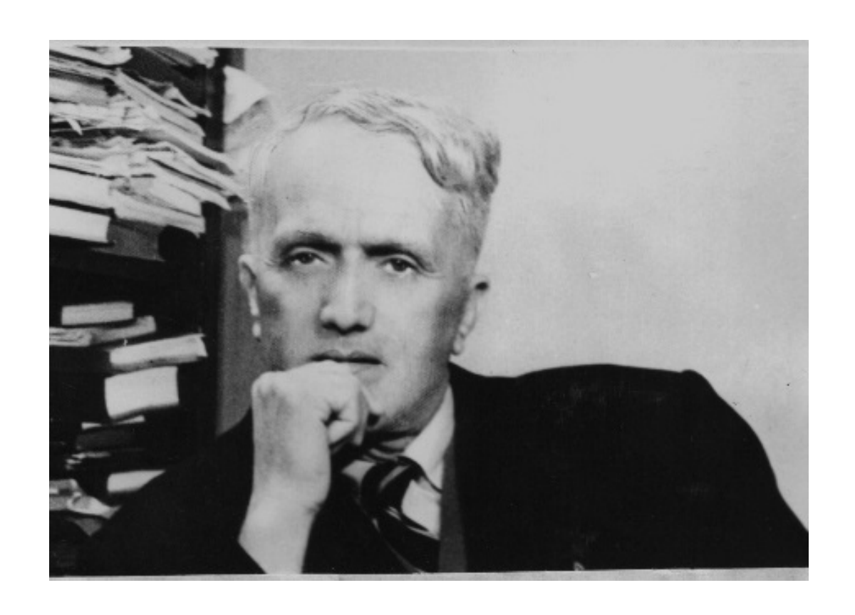
Dedicated to the 120-th anniversary of Academician Victor Kupradze